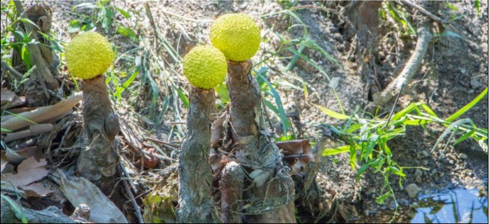
Campus Creek Installations

College of Architecture, Planning &amp; Design