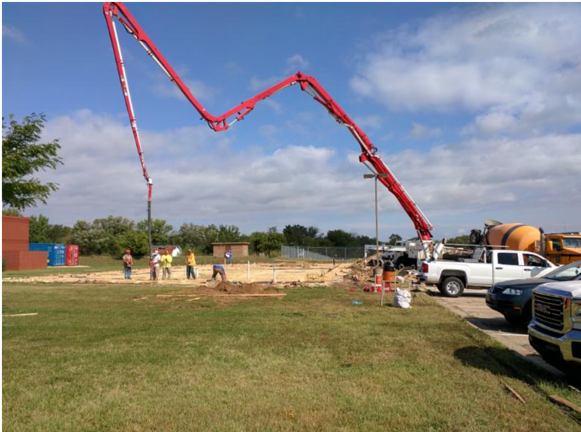
Footings for APD West metal building being poured

THE COLLEGE of ARCHITECTURE, PLANNING & DESIGN // K-STATE