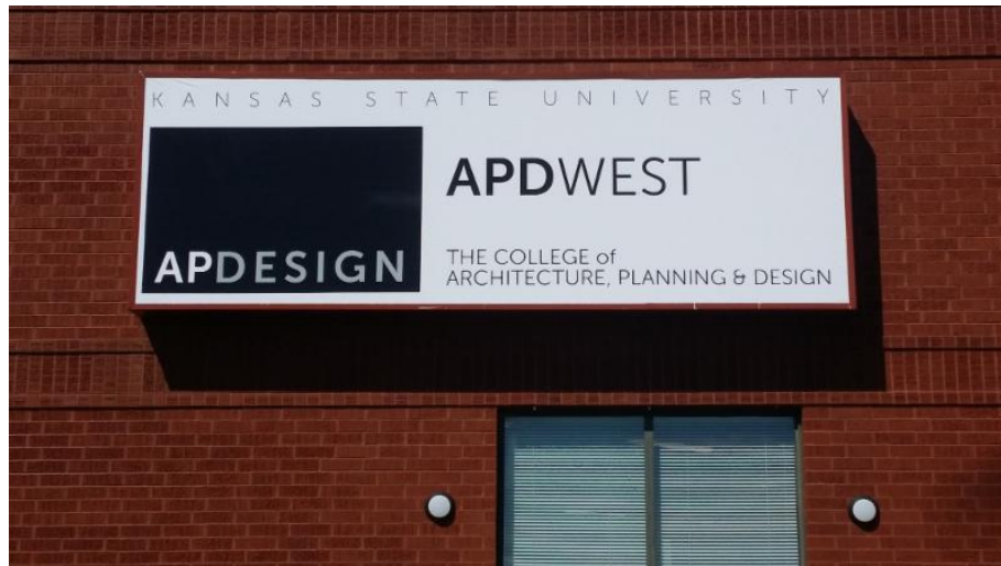
New sign installed at APD West

College of Architecture, Planning & Design