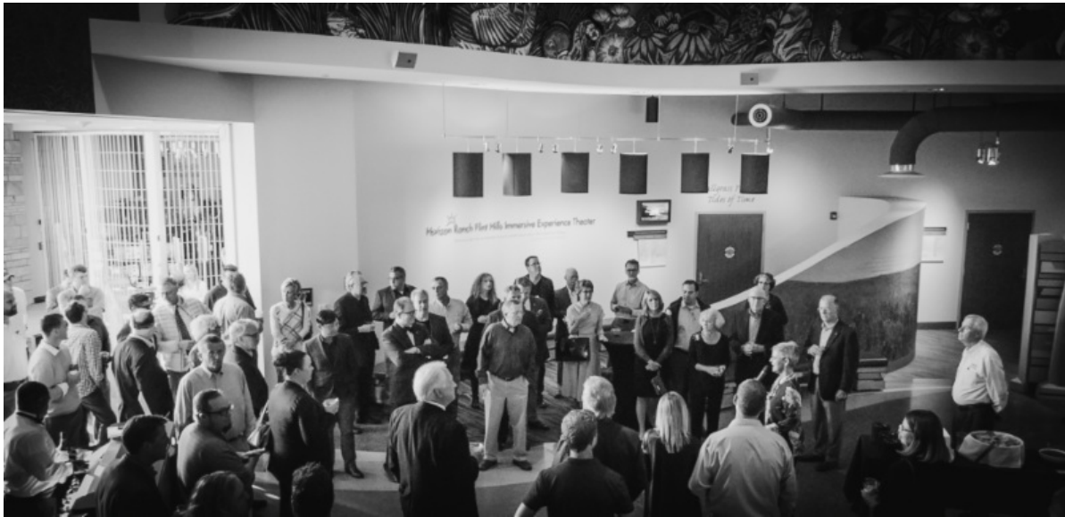
2016 AIA Central State Region Conference - Co-Hosted by APDesign this weekend