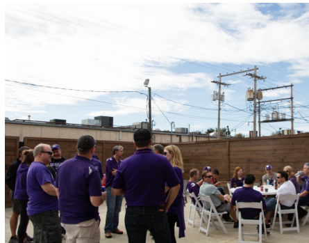
Productive APDesign Weekend, Scholarship Reception, Thurs, DAC, Fri, Tailgate, Sat