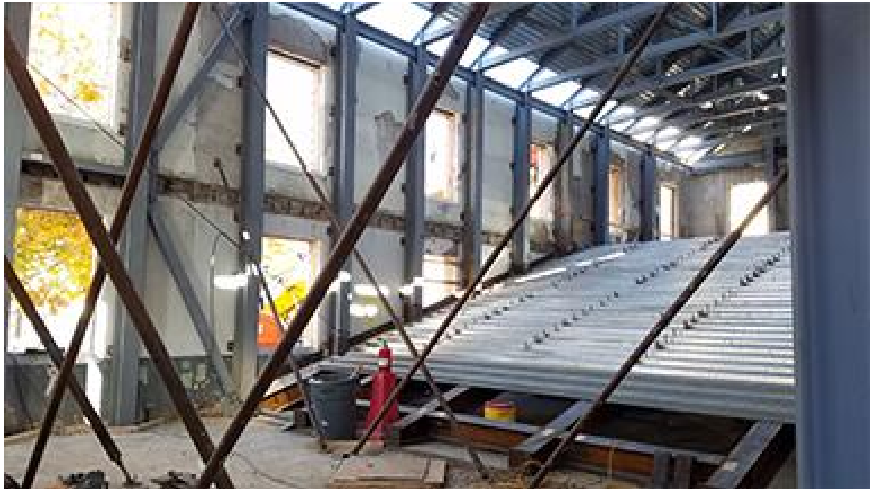
A peek into Regnier Forum. Looking to the east, the structural steel has been installed. In a short time, this space will be transformed to the college's premier lecture space ready for incredible guest lectures, panels, etc. Click on the photo to read about the current progress on the new building: Photo by Lisa Shubert