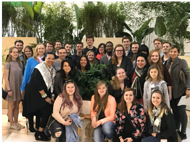
Italian Studies Program Students and K-State Faculty