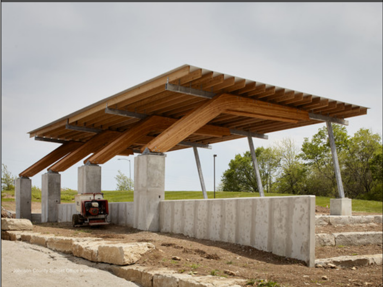
Johnson County Sunset Office Pavilion