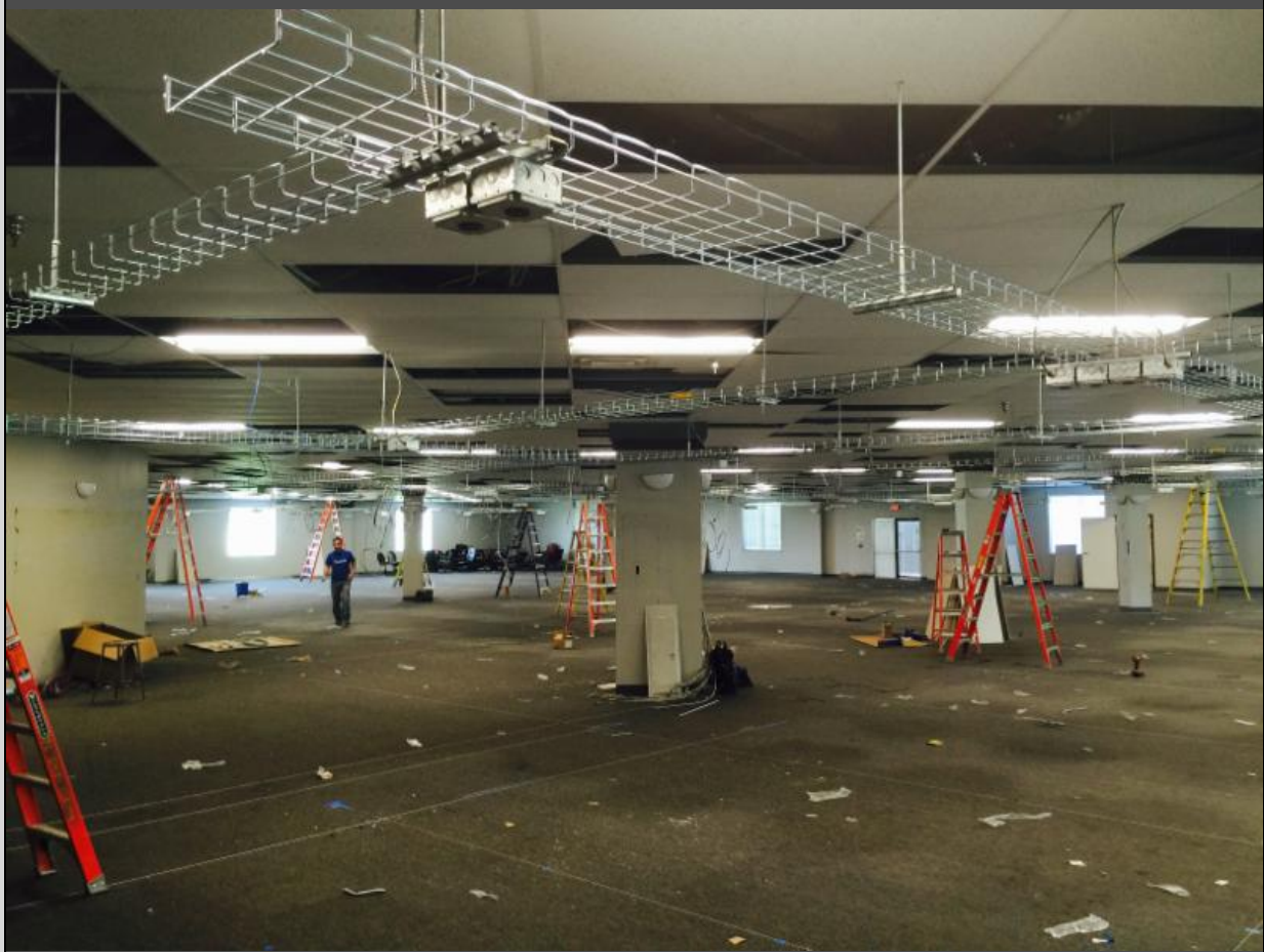
APDesign West racks are up and work is moving very fast!

College of Architecture, Planning & Design